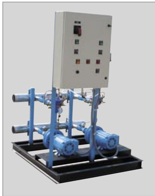
Flo-Pak Aqua-FloPak™ Booster Packages For Plumbing Systems.

Plumbing. Sometimes municipal service is either unavailable or insufficient in pressure or flow. Building owners must turn to plumbing contractors for their water supply solutions. Contractors depend on Flo-Pak Aqua-FloPak™ booster packages to provide independent water systems with efficient, dependable service. Versatile Aqua-FloPak packages also provide dependable water service at controlled volume and pressure for high-rise residential structures, office buildings, dormitories and similar facilities.