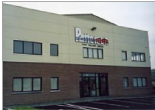
Patterson Mullingar, Ireland, Factory.

Whether in our USA or Ireland factory, the result is high-precision workmanship with rapid delivery, especially important in fulfilling critical needs. Individual skills are integral to whole system quality—the reason our plate shop personnel are fully qualified in accordance with Section IX of the ASME Code for all types of approved welding.