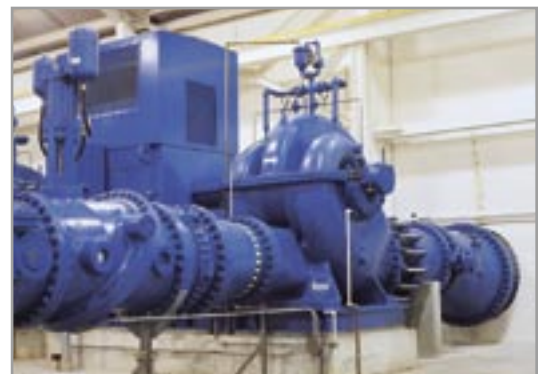
Patterson Horizontal Split Case Pump Station.

Type “F” Horizontal and Vertical Centrifugal Pumps are Patterson’s heavy duty, non-clogging workhorses for sewage plants and other applications involving sludge, drainage, pulp, food byproducts or other unscreened solids with diameters up to 8 in. The Type “F” concept spans more than 17 standard models and many custom configurations. Special wear resistant castings extend service life with abrasive slurries. Capacities range from 500 to 100,000 gpm, with heads to 150 ft.