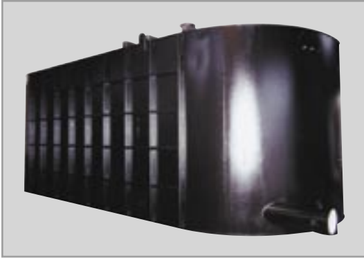
Enclosed Underground Booster Pump Packages.

Special-duty packages for underground service or needs outside our standard packages are a Patterson specialty. With our flexible design concepts, we can engineer a package to meet your needs.