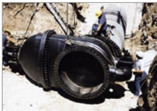
L-R Double-Disc Gate Valve.

Patterson Multi-purpose Vertical Turbine (MPVT®) Pumps are widely used in municipal/ industrial solids handling, water treatment, flood control and water supply applications. Standard units are available with bowl sizes from 12 in. to 40 in. and capacities ranging from 1,500 to 20,000 gpm and above. Easily integrated into existing installations, these pumps operate in low NPSHA applications. Since pump discharge, motor and controller are above grade, component maintenance is easy and safe.