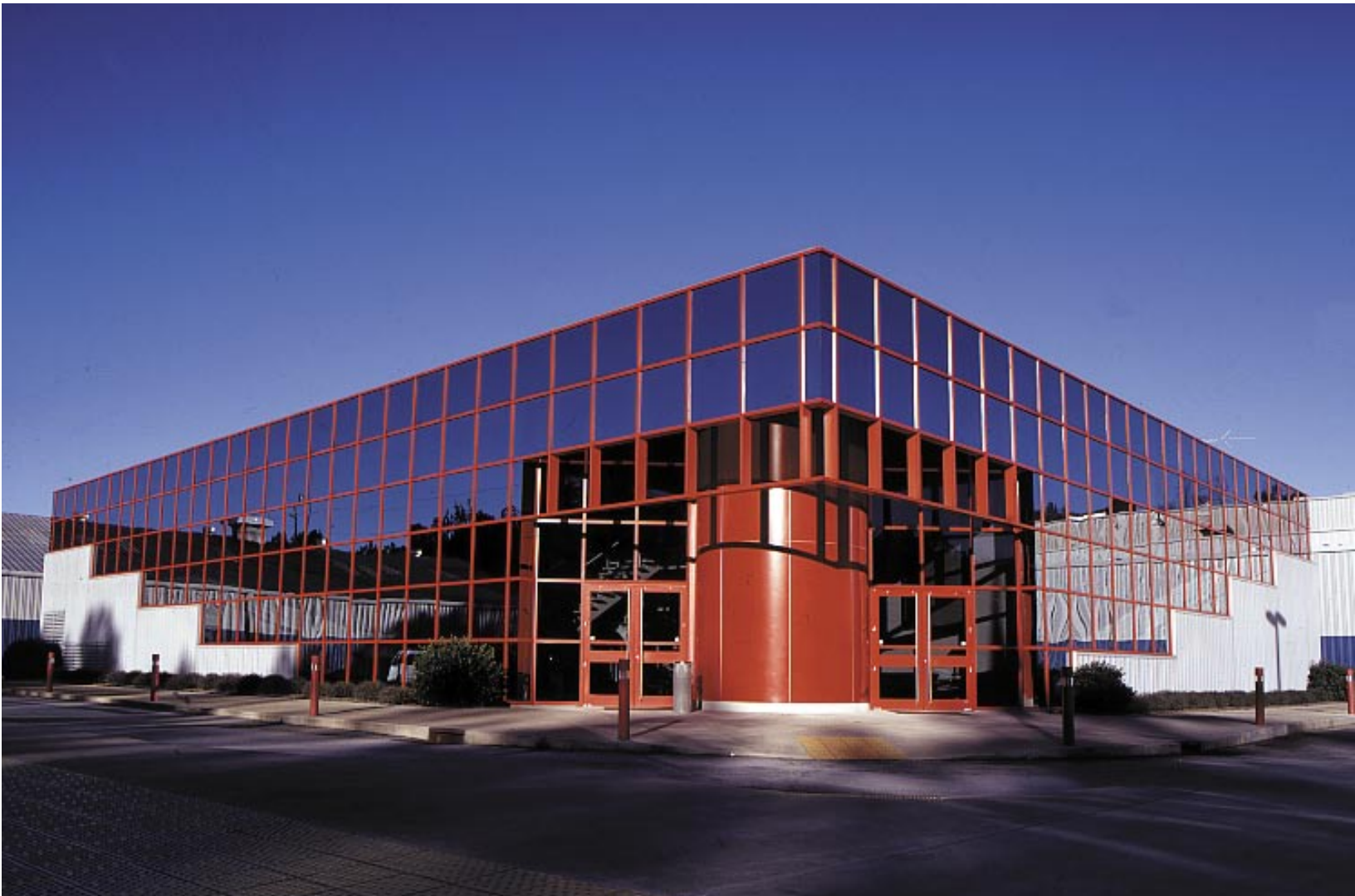
Patterson Toccoa, GA, Headquarters which include a modern training facility and a comprehensive test laboratory.