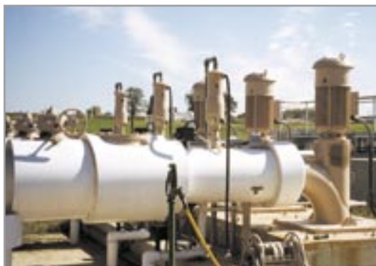
MPVT® Vertical Turbine Pump Station.

Today's Patterson Vertical Turbine Pumps offer benefits gained by years of refinement, with exceptional hydraulic performance and low vibration and noise levels. Multiple stages meet pressure requirements with a minimal footprint. Standard units have cast iron discharge heads and cast iron bronze fitted bowls. Optional stainless steel or aluminum bronze construction is available, and fabricated steel heads in lieu of cast iron are available in both above- and below-grade discharge configurations.