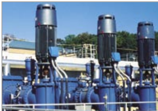
PVT Vertical Turbine Pump Station.

efficiency. They meet Hydraulic Institute Standards in capacities from 50 to over 100,000 gpm, with single stage heads to 550 ft and two stage heads to 1,150 ft. Vertical configurations and custom designs are available.