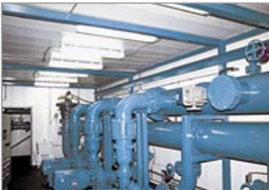
Industrial Pump Station Packages.

Industrial. For large-capacity process cooling service, Patterson engineers Flo-Pak packages with variable frequency or constant speed drives to follow cooling load with maximum energy efficiency. Other specialized industrial packages include high-pressure systems for such uses as filter press showers, water jet cutting, debarking, filtering and filter backflushing.