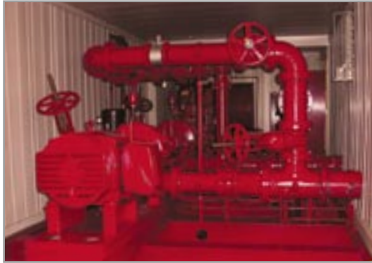
Patterson Pre-Pac® Fire Pump Package.

include suction diffusers, valves (multi-duty, circuit balancing, automatic vent and makeup water pressure reducing), air separators and scoops, heat exchangers (shell & tube and plate & frame), flowmeters, expansion tanks and flexible connectors.