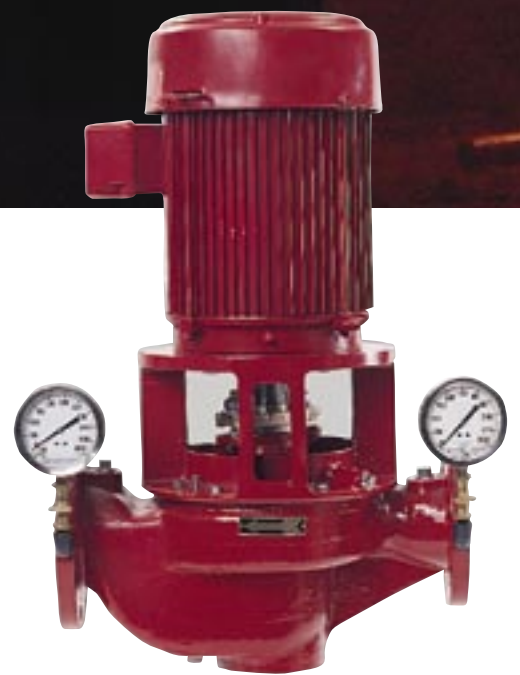
Patterson Vertical In-line (V.I.P.) fire pumps stand ready to deliver instant volume at pressures up to 150 psi.