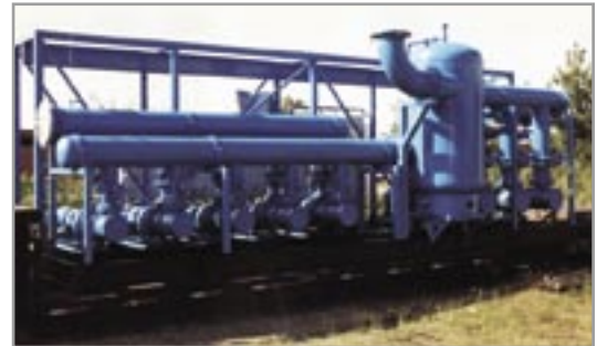
Patterson Flo-Pak® Primary and Secondary Pump Packages.

HVAC. The simplicity of packages in district heating systems and within the building envelope significantly aids maintainability. Patterson has Flo-Pak packages for hydronic heating and heat transfer stations, complete chillers, primary and secondary (booster) pump packages, water source heat pump stations, condenser water pump skids, hot water heating circulators and variable load primary systems.